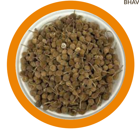
GORAKHMUNDI (Sphaeranthus Indicus)