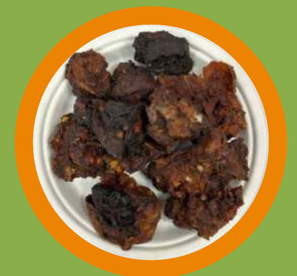
BELGUDA (Dry Aegle Marmelos)