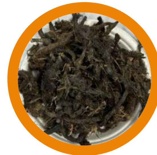
NAGARMOTHA ( Cyperus Scariosus )