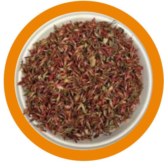
DHAWAIPHOOL (Woodfordia Fruticosa)