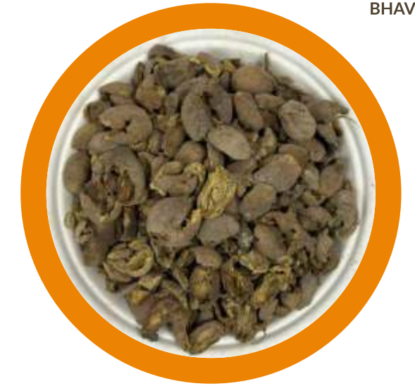
Baheda (Terminalia Bellirica)