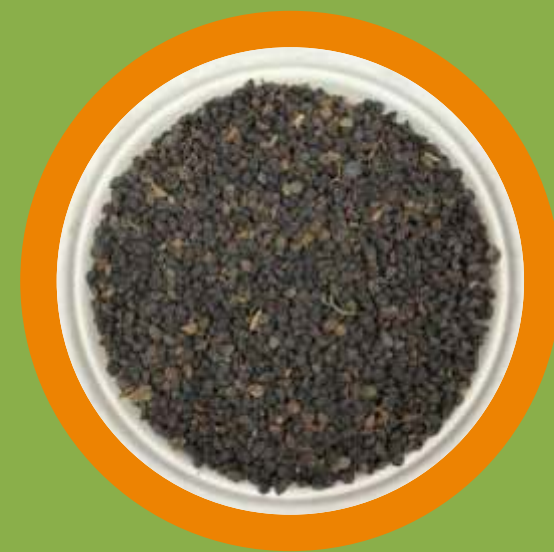
KALADANA (Ipomoea Hederacea)