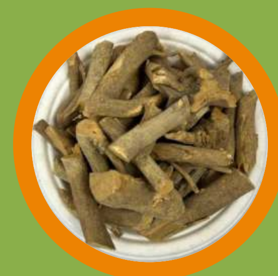
SARPAGANDHA NO2 ( Rauvolfia Serpentina )