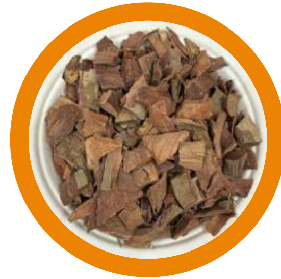
ARJUN (Terminalia Arjuna)