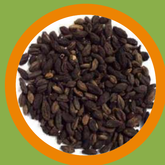
BAL HARAD (Terminaliachebula)