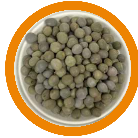
GATARAN (Caesalpinia Crista)