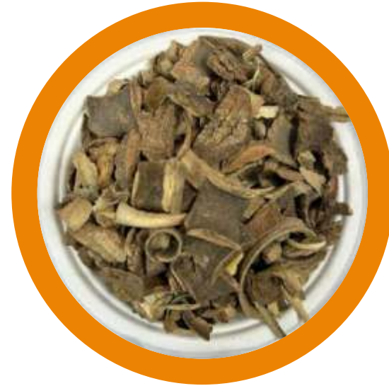
KUDA ( Holarrhena Antidysenterica )