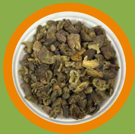
HARRA (Terminalia Chebula)