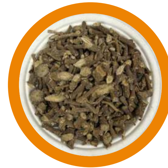
GILOE (Tinospora Cordifolia)