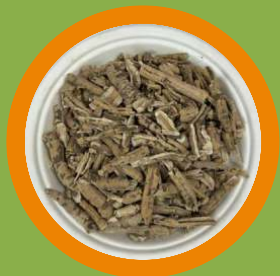
NISOTHNO1 ( Operculinaturpethum )