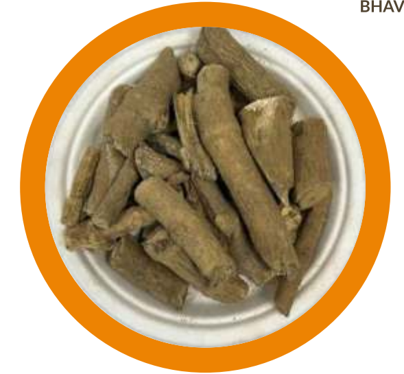
NISOTH NO2 ( Operculinaturpethum )