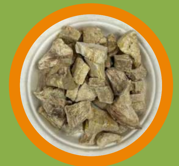
VIDARIKAND ( Pueraria Tuberosa )