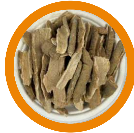
LODHRA ( Symplocos racemosaroxb )