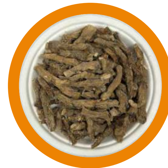
BACH (Acorus Calamus)