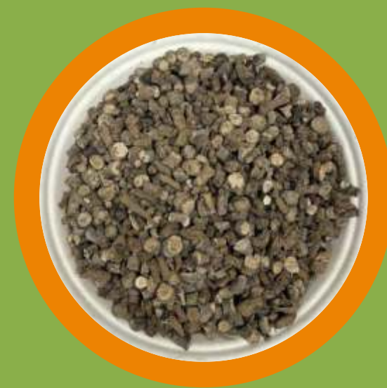
KALI MUSLI (Curculigoorchioides)