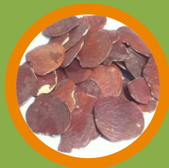
PALASHBEEJ ( Butea Monosperma )