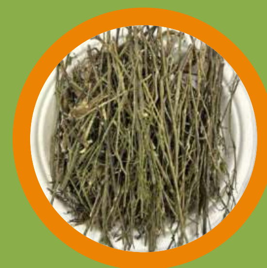
KALMEGH Andrographis Paniculate)