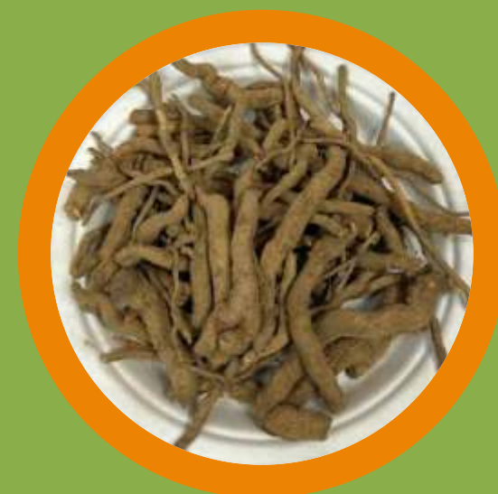
SARPAGANDHA NO1 ( Rauvolfia Serpentina )