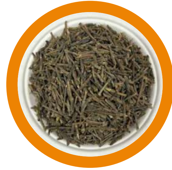
DIKAMALI (Gardenia gummifera Linn)