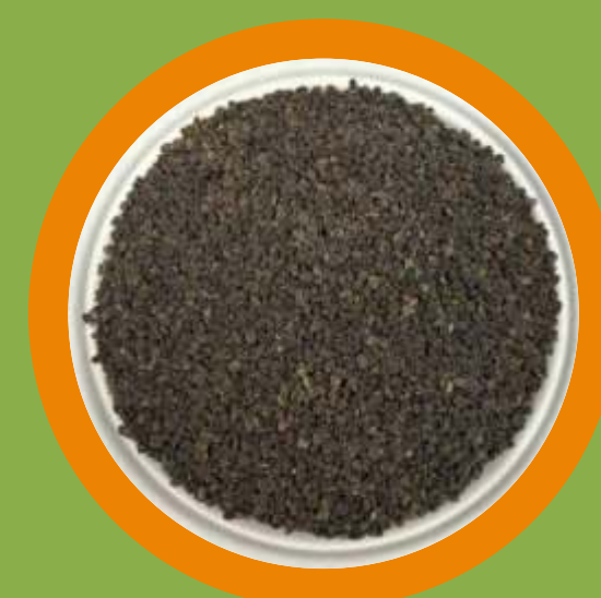
BAUCHI (Psoralea corylifolia)