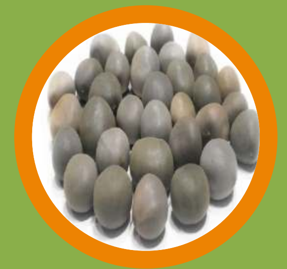
KARANJABEEJ (Milletia Pinnata)