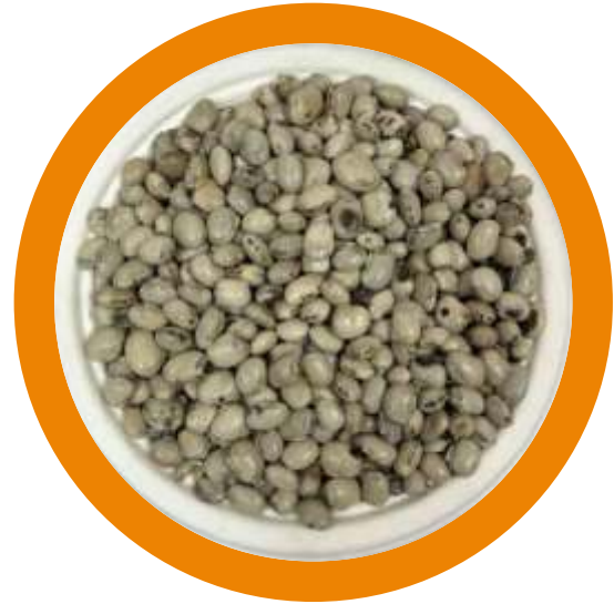
KAUNCH BEEJ ( Mucuna Pruriens )